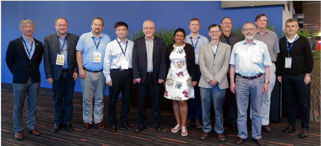
Fig. 1. First meeting of the IAG Executive Committee in Montreal 2019